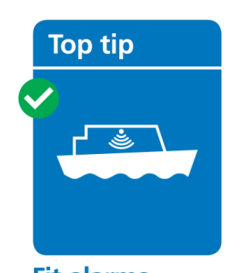
Fit alarms and detectors to stay safe

Many people do not appreciate the risks associated with boats and their domestic equipment and installations. Even a moderate sized boat can carry hundreds of litres of diesel, dozens of kilograms of Liquefied Petroleum Gas (LPG) and 20-50 litres of petrol. These fuels are combined with readily combustible materials such as wood and glass-reinforced-plastic and they are all placed in close proximity of sources of