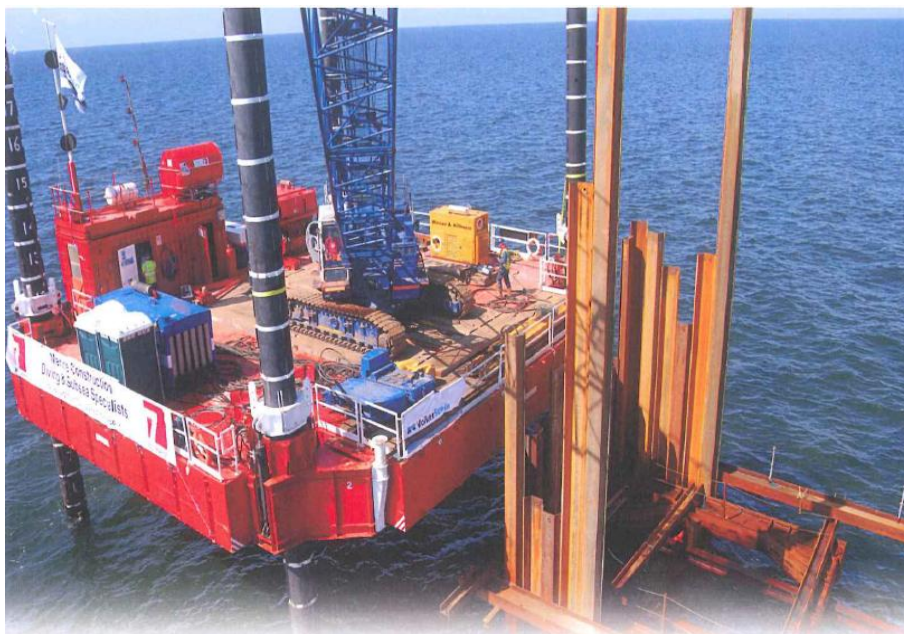
HAVEN SEA JACK 1