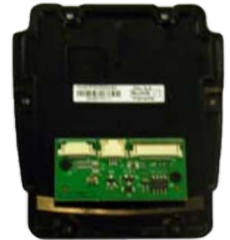
Inside Back Cover

WA9301 Trigger Board for Lorax Laser End-Cap