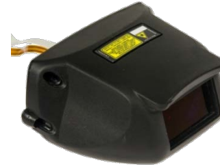
WA9022 1D Lorax Laser

For all other end-cap engines, a trigger board WA9302 is required ONLY when using the pistol grip.