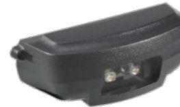
WA9018 1D Linear Imager