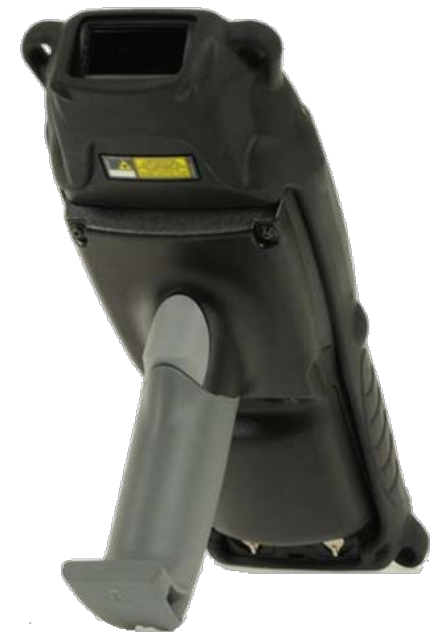
WA6402 Rubber Boot for Long Extended Range Laser