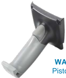
WA6103 Pistol Grip

Pistol grip attachment kit. Includes flush mount pistol grip with trigger, and screws