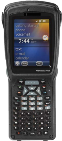
Microsoft Windows Embedded Handheld 6.5 Classic Edition