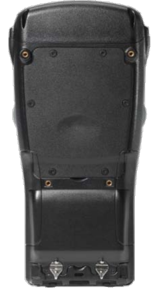
WA6208 Standard Blank Back-Cover