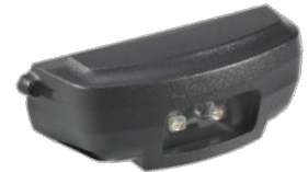
WA9020 2D Imager