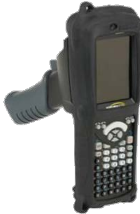
WA6400 Rubber Boot

WA6402 Rubber boot for use with long extended range laser configuration with/without using pistol grip