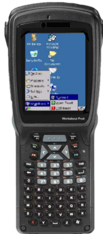
Microsoft Windows Embedded Compact 6.0