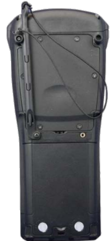
WA6310-G1 Mobile Stylus with Holder Kit