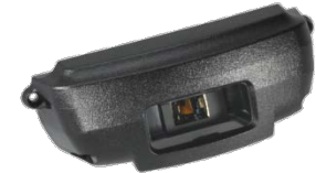
WA9016 1D Standard Range Laser