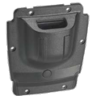
WA9017 1D Linear Imager

! All covers, slim pods and pistol grip are compatible with short and long configurations Slim pods have built in trigger boards !