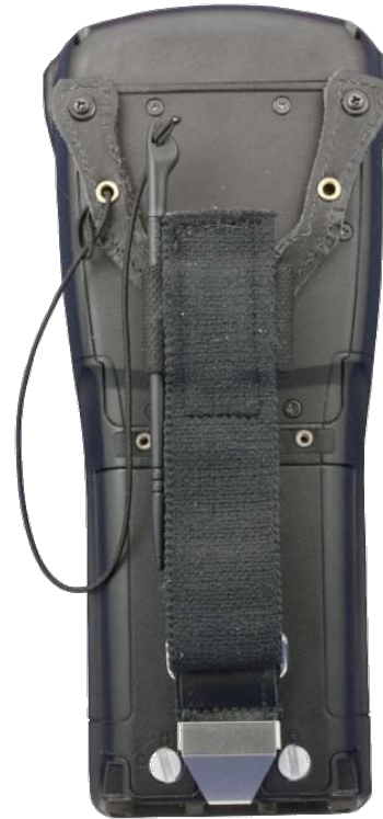
WA6025 Hand Strap with Mobile Stylus