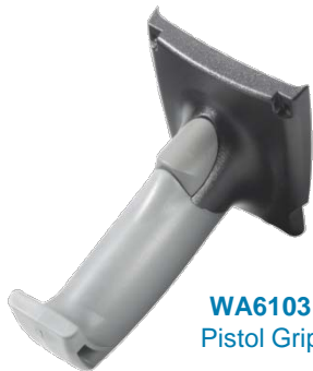
WA6103 Pistol Grip

WA6103 Pistol grip attachment kit. Includes flush mount pistol grip with trigger, and screws