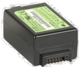
WA3010 4400 mAh