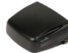
WA6213 Multi-purpose end cap