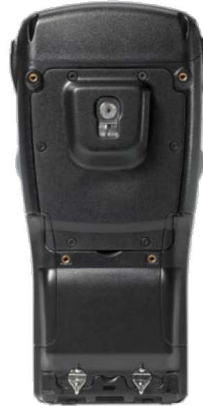
WA9021 8MP Camera Module

Applicable only for Upgrades / Reconfiguration