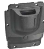
WA9019 2D Imager