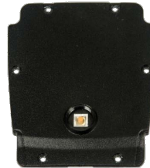
Trigger Board Back Cover

Trigger board WA9302 is required for 1D laser or 1D/2D imager ONLY when using the pistol grip