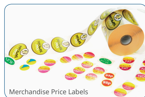
Merchandise Price Labels

PRE-PRINT / BUREAU LABELS: When you need labelling but don't have the facility or capacity, Supplyline can provide the service for Racking & Shelf-Edge, Barcode (inc sequentially printed), Serial Numbers, Asset, Security, Textile, Garment, Swing Tickets, Shipping, Odette, Packaging, Clear and Laminated.