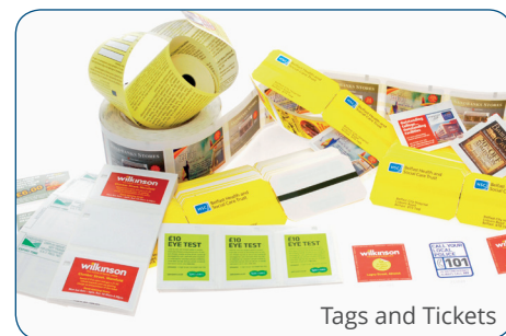
Tags and Tickets

INGREDIENT LABELS: Ingredient labels may need to withstand cold and hot temperatures, contact with substances (e.g. oils) and handling. We offer free advice on papers and adhesives to maintain perfect label functionality and appearance.